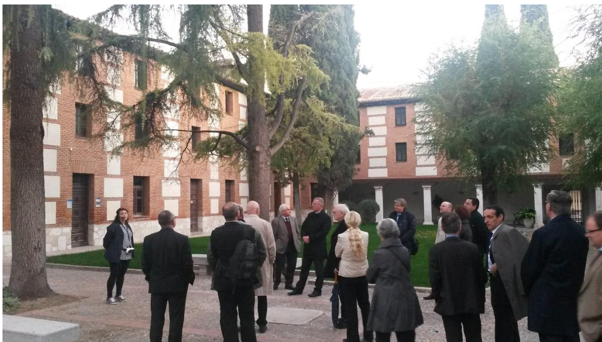
University of Alcalá de Henares, 14 th November 2015. Members of the Consortium on a tour of the historic part of the university, XXVII meeting on Law and Religion in Workplace from 12 th to 15 th November 2015.

But nice memories of previous years remain! The first meeting attended by one of the authors of this paper was held in Tübingen (Germany) in November 2004, and since 2006 both authors have been attending all meetings regularly. We bring a few photos as a memory with the hope that the epidemic will pass, and the meetings will continue.