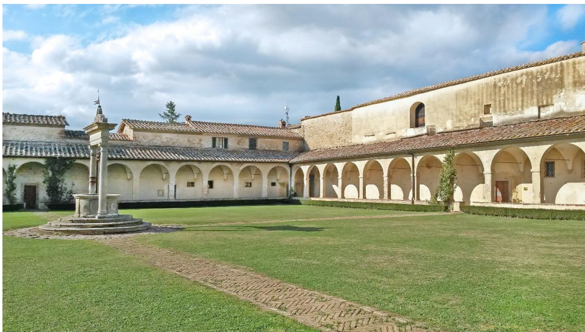
Certosa di Pontignano near Siena, 14 th November 2018. XXX meeting of the Consortium on the topic Legal Status of Old and New Religious Minorities in the European Union.