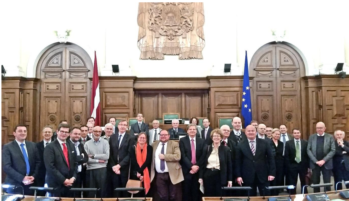
Parliament of the State of Latvia (Saeima) in Riga, 15 th October 2016. Participants of the XXVIII Consortium meeting in the Latvian resort of Jūrmala on the topic Religious Assistance in Public Institutions during a visit to Riga.