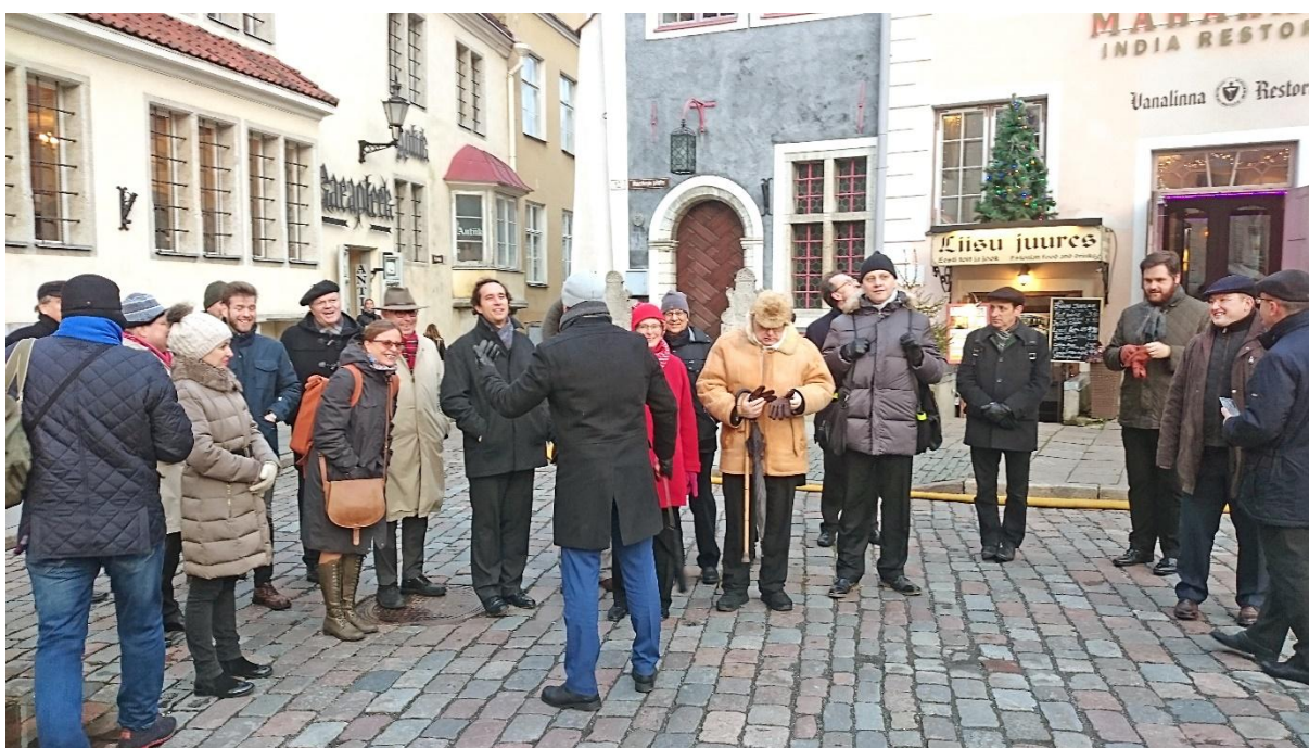
Tallinn, historic city centre, 17 th November 2017. Participants of the XXIX meeting of the Consortium on Securitization of Religious Freedom – Religion and Scope of State Control on a tour of the Estonian capital.